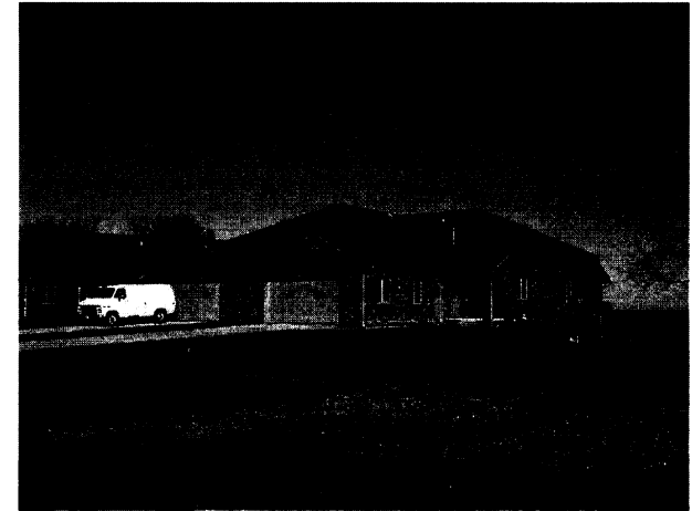
200 CASINO RD